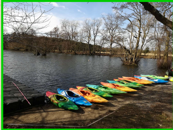
Lake for activities on site