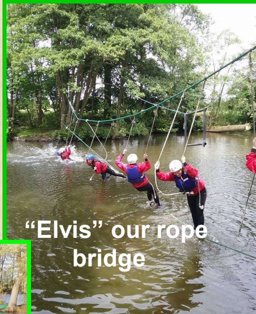
“Elvis” our rope bridge